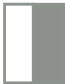
1/2 page portrait