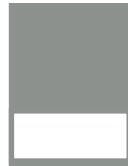
1/3 page landscape